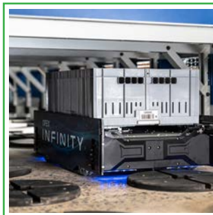
UNDER RACK MOVEMENT