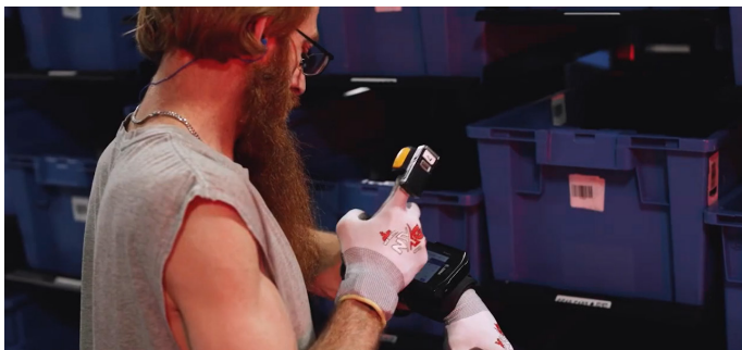
Operator with S20 Sweeper App on wrist computer