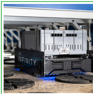
UNDER RACK MOVEMENT